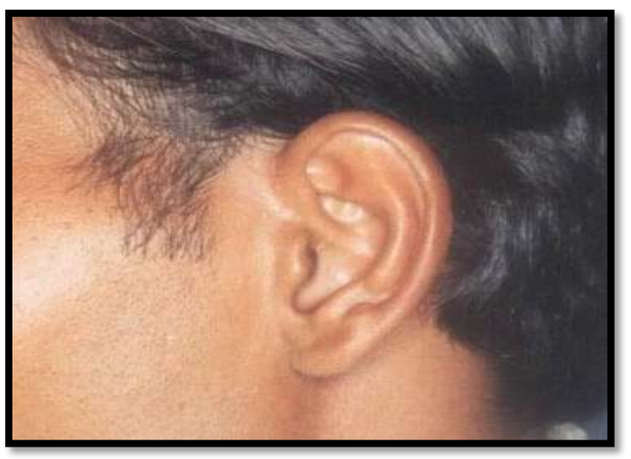
Patient with normal ear on left side.

Three horizontal markings are made on the normal ear with indelible pencil