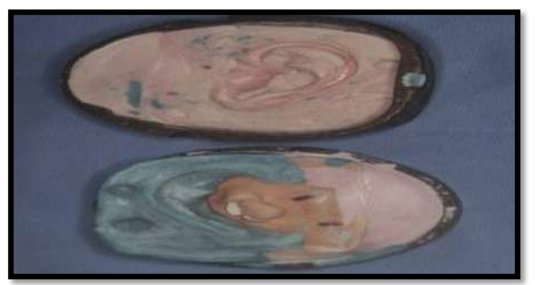
Three piece mold