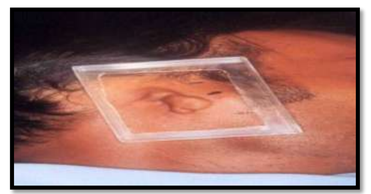
Customized tray in place defect site.