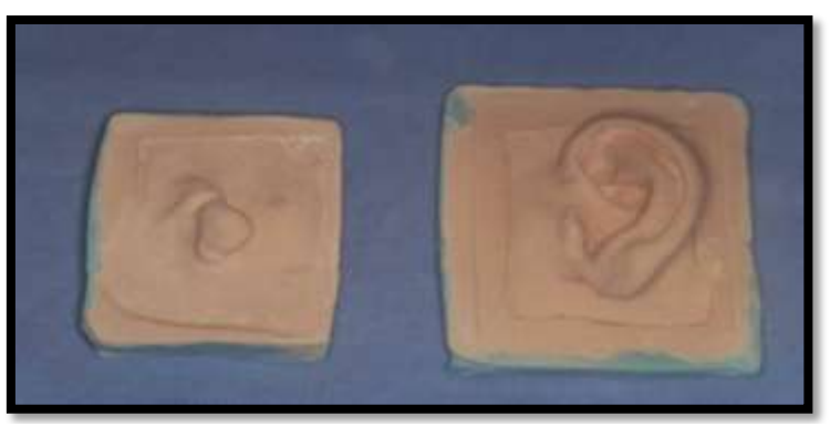
Casts of defect site and normal ear.

Now tray is boxed with modeling wax and poured with the dental stone to get the master cast of the defect site and the cast of the normal ear