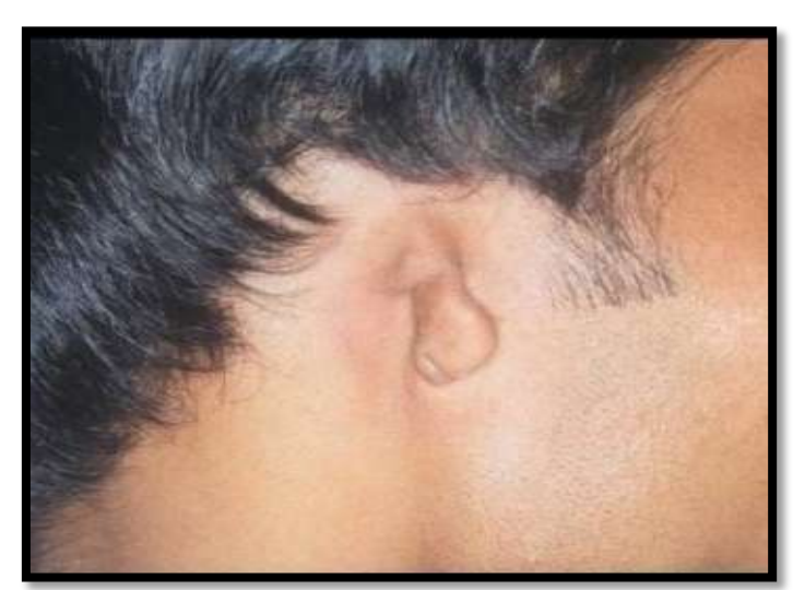
Defect site showing patient with congenitally missing ear right side.

A 28 year male patient presented with congenital anotia on the right side On examination the defect site was having healthy tissue bed with rudimentary tissue tag at the level of tragus and the left ear was normal. The patient is planned for rehabilitation with adhesive retained silicone ear prosthesis.