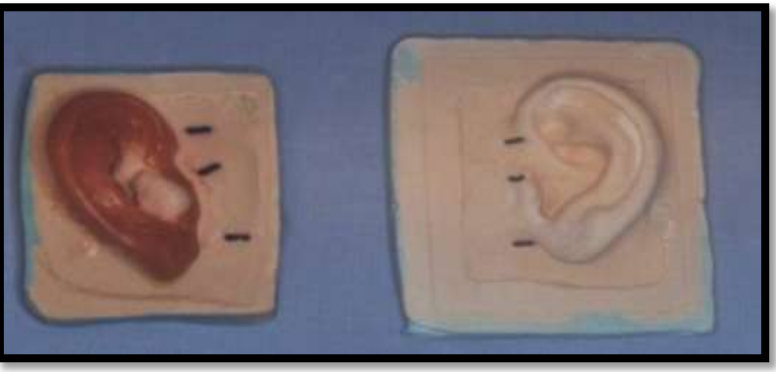
Casts of defect site with wax pattern and normal ear