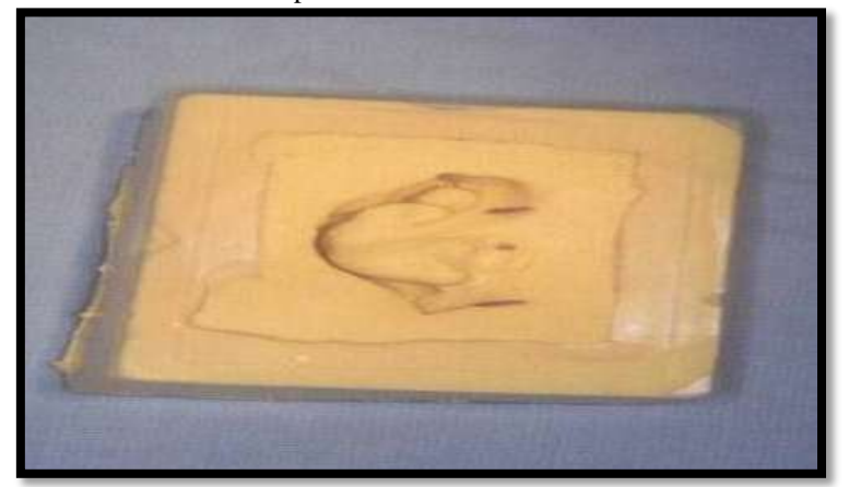
Impression of the normal ear

Now tray is boxed with modeling wax and poured with the dental stone to get the master cast of the defect site and the cast of the normal ear