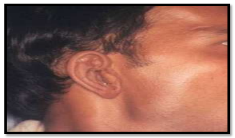
Ear prosthesis in place

• Patient is educated for placement and removal of the ear prosthesis. Home care regarding cleaning of prosthesis is also explained to the patient so as to keep tissue bed healthy. Finally the prosthesis is delivered to the patient.