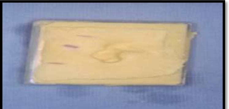
Impression of the defect site